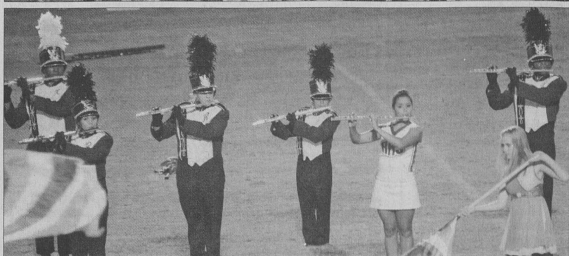
Top: The crowd cheers on the Raiders during Friday's win. Bottom: The band performs during halftime.